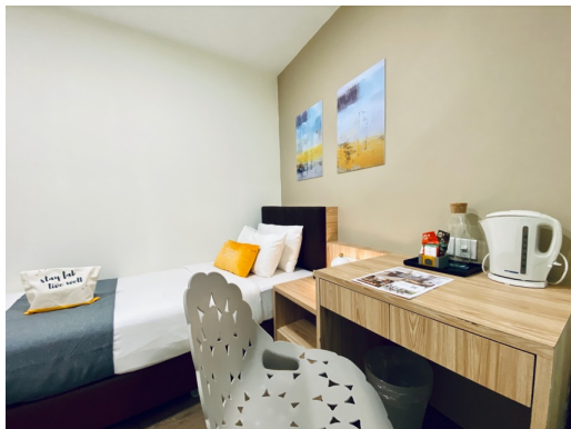
Photo link: https://drive.google.com/drive/folders/1cE2on-u5fuToMWFYjlyMapElGorBklwS

Rate: $2500 Nett per month -(based on 30 nights)- Min 5 months lease