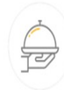
24/7 Customer Service