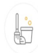
Housekeeping & Maintenance